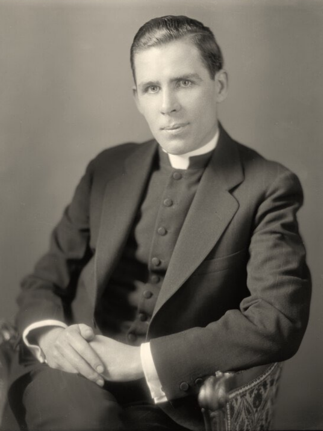
Rev. Fulton J. Sheen, early in his priesthood.

Source: Harris & Ewing, photographer. Public domain, via Wikimedia Commons.