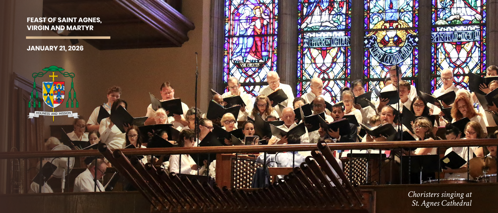
Choristers singing at St. Agnes Cathedral