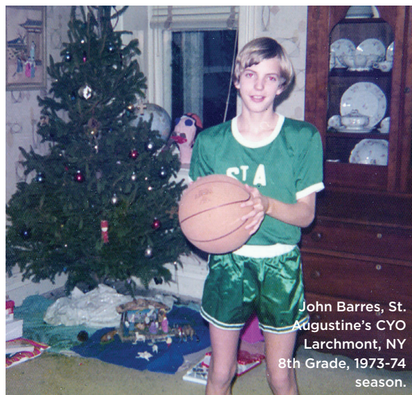
John Barres, St. Augustine's CYO Larchmont, NY 8th Grade, 1973-74 season.

3 Thank you for the way you model a respect for the dignity of the individual in your sportsmanship and classy treatment of opposing team coaches and players, referees and the crowds at games. You teach us how to compete with class, character, mature self-possession and charity.