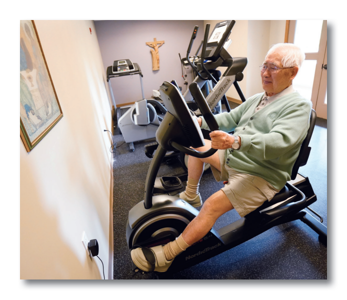
"At St. Pius X, we are surrounded by fresh air and green nature. I enjoy looking out my window at the trees, the Canadian geese and even the deer that sometimes roam the property."