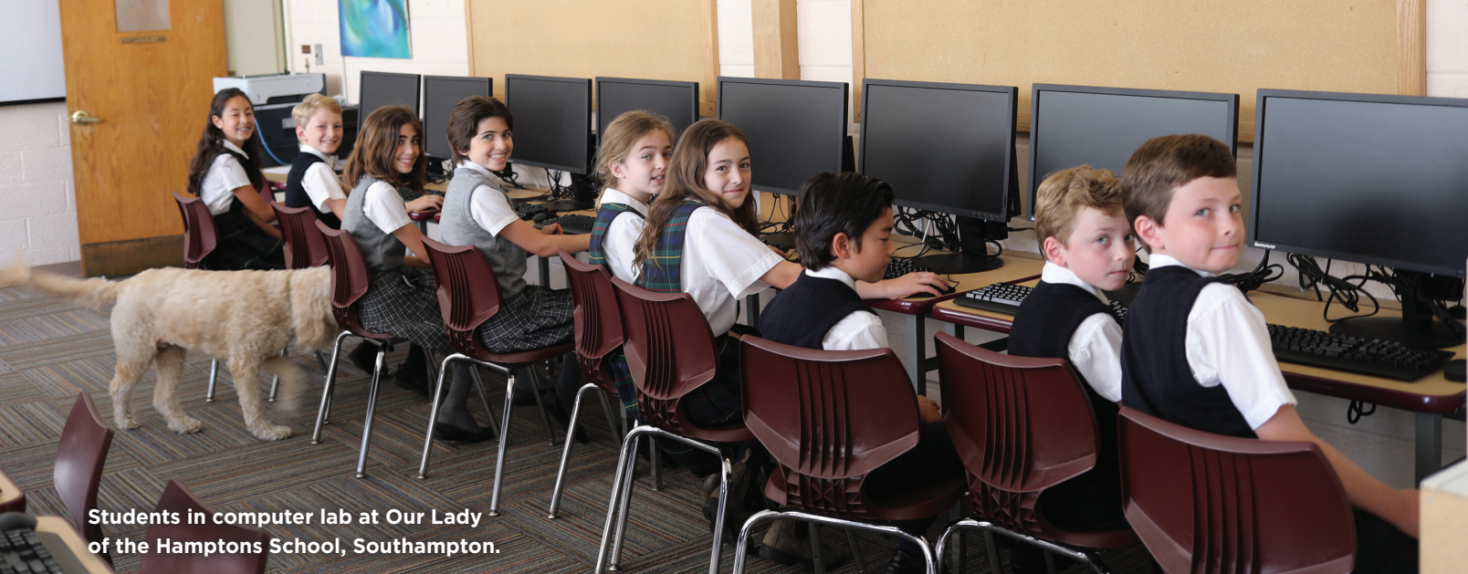
Students in computer lab at Our Lady of the Hamptons School, Southampton.