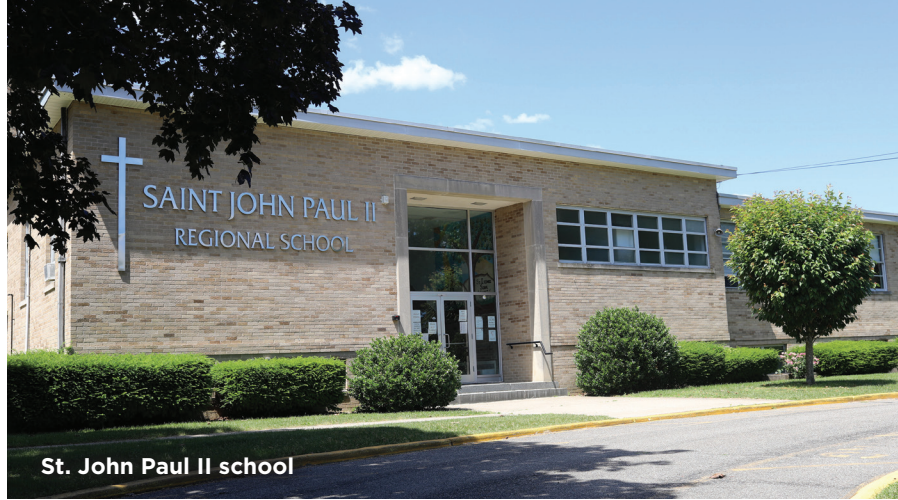
St. John Paul II school

website, Trinity has scheduled many one-on-one in-person tours of campus that allow parents to see all the school has to offer. The marketing and branding of the school along with staff availability to meet with prospective families led to a sustainable district enrollment.