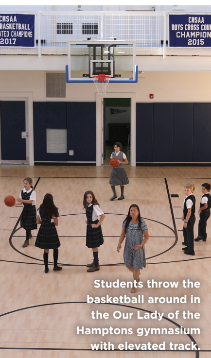
Students throw the basketball around in the Our Lady of the Hamptons gymnasium with elevated track.