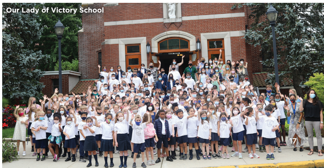
Our Lady of Victory School