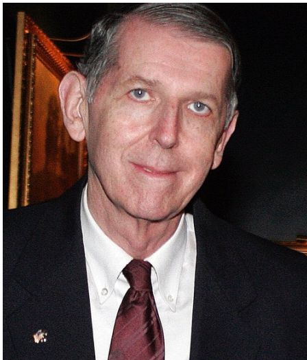
Tom Konchalski

On September 10, 2021, I attended an evening of tribute for a man named Tom Konchalski at Archbishop Molloy High School. 1