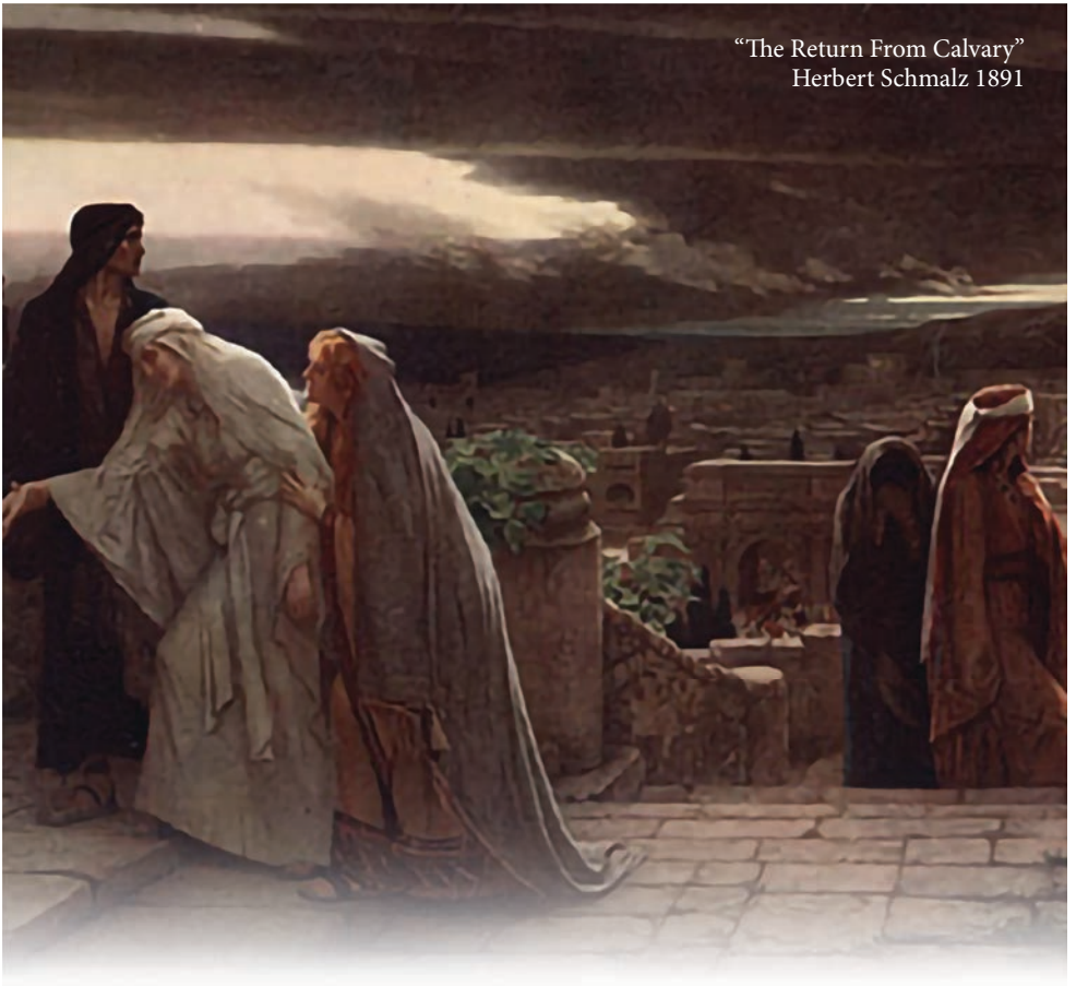
"The Return From Calvary" Herbert Schmalz 1891