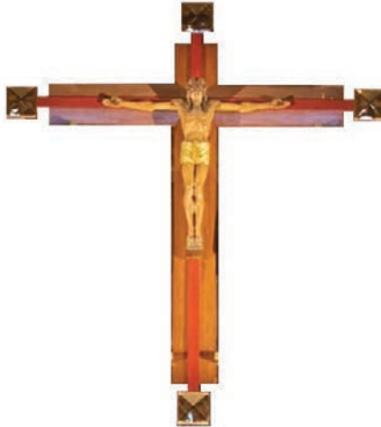
Crucifix over Altar: St. Agnes Cathedral

All: Because by your holy cross you have redeemed the world.